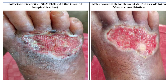
[Table/Fig-5]: Image showing IWGDF/IDSA DFU infection severity (Severe infection at the time of hospitalization and after 5 days of intravenous antibiotics).