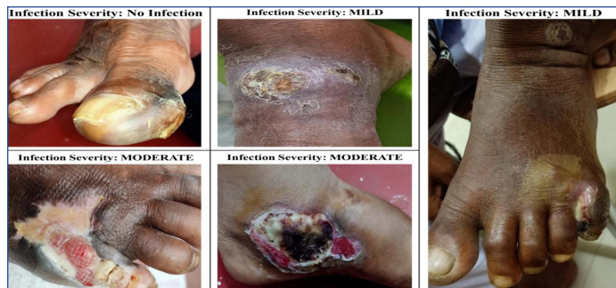
[Table/Fig-4]: Image showing IWGDF/IDSA DFU infection severity (No infection, mild Infection and moderate Infection).

Increasing age (p-value=0.023), rural residence (p-value=0.015), poor education (p-value=0.001), obesity (p-value=0.001), central obesity (p-value=0.001) was found to be significant risk factors for severe infection in DFU. Longer duration of diabetes was associated with significant (p-value=0.028) higher risk of severe DFU infection. Poor glycemic (HbA1c>7%) was found to be a significant (p-value=0.001) risk factor for severe diabetic foot ulcer infection [Table/Fig-6].